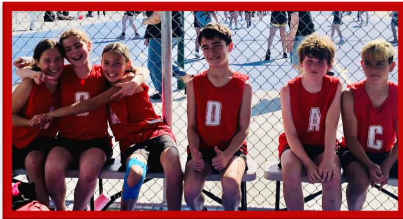
Diamonds with red cheeks and cheeky smiles after seven games of netball

The Diamonds beat Northland 5-2 to take home the Bronze Medal, so congratulations to the kids. This is a big turnaround from last year when the Diamonds finished 12 th , so their mahi has seen them make big strides in their netball development over the past 12 months.