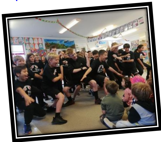
KAPA HAKA performance group at Adventure Kindy